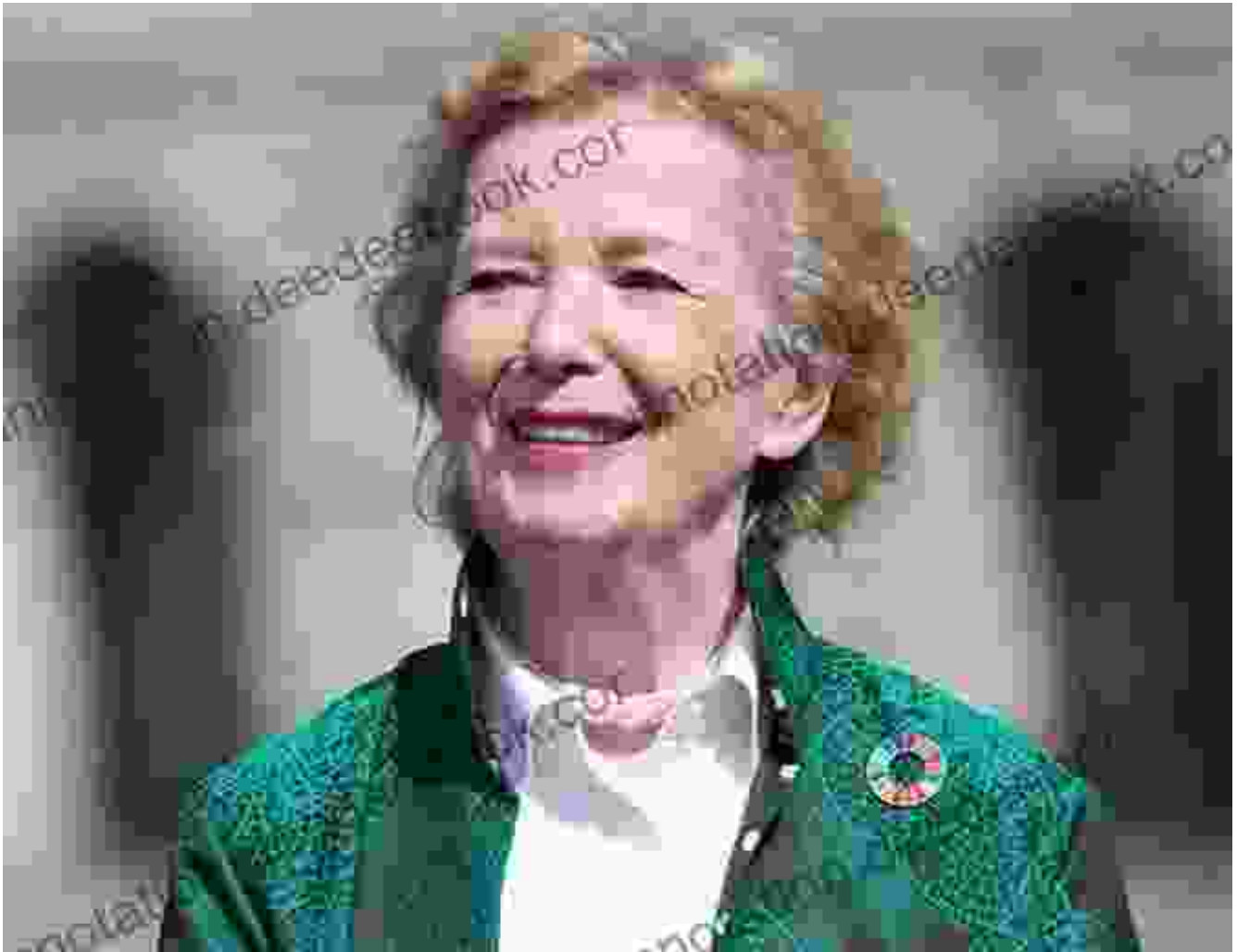
Mary Robinson as the President of Ireland.

In 1990, Robinson became Ireland's seventh president, making history as the nation's first female head of state. Her presidency was marked by her unwavering commitment to human rights, peacebuilding, and social justice.